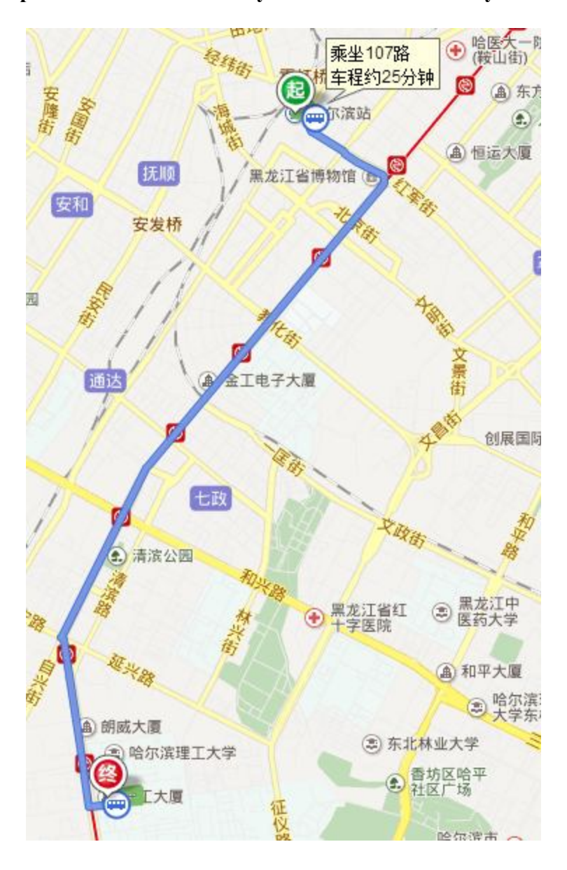
Map 1: From Harbin railway station to Hanlin Tianyue Hotel